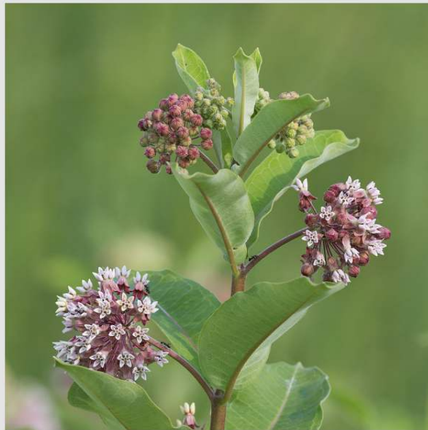
Common Milkweed, Asclepias syriaca, Union County, Ohio, June 27, 2019