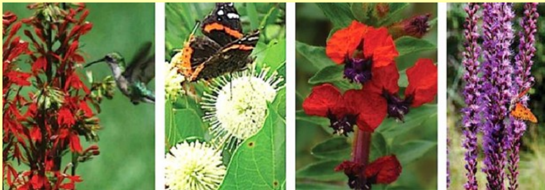
Pollinator-attracting plants, above l to r: Cardinal flower, buttonbush, batface cuphea and liatris. Below, l to r, joepyee weed (an eupatorium), St. Elmo's Fire rusellia, Gregg's mistflower and Texas olive tree