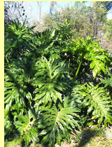
Left: Albo — most rare, coveted aroid Unicorn Plant! ("when you find one it is like finding a Unicorn!" Center: Scindapsis from Peru. Right: Philodendron selloum -- a common aroid / hardy to grow outside.