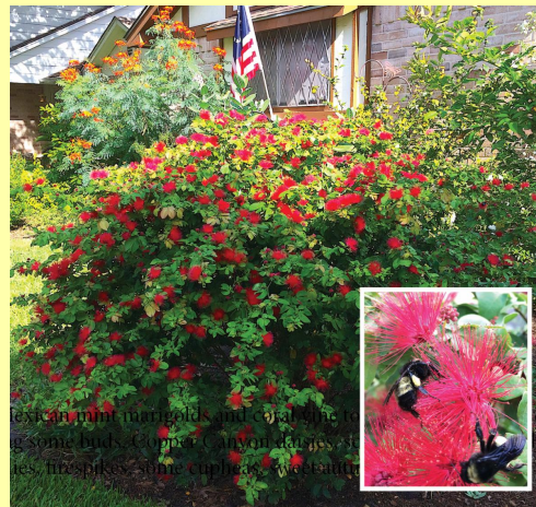
Above, Paula Bazan's pink powderpuff and friends (insert)

In late July, Paula prunes her flame acanthus, 'Hot Lips' salvia and Ximenia (gerberas) to ensure more new blooms for fall-arriving/year-round butterflies and hummingbirds. Snipping also triggers more flowers and/or beans/seeds on her purple porterweed, firespike, esperanza and golden dewdrop (duranta).