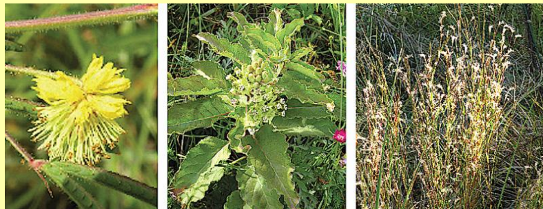
L to R: Tropical puff, Zizotes milkweed and little bluestem