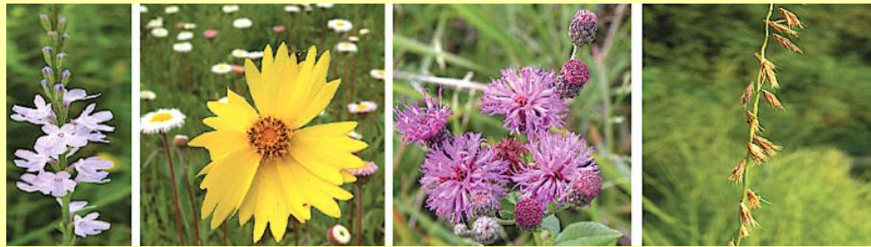
L to R: Gulf vervain, Lanceleaf coreopsis, Missouri ironweed and Sideoats grama.