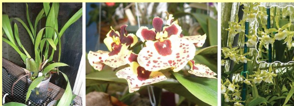
L to r: pseudo-bulb at base, Tolumnia 'Alemeda Beth,' and Onc. Irish Mist 'Wintergreen' with closeup insert

DANCING LADIES & OTHER ORCHIDS THAT LOVE OUR SUMMER HOUSTON CLIMATE!