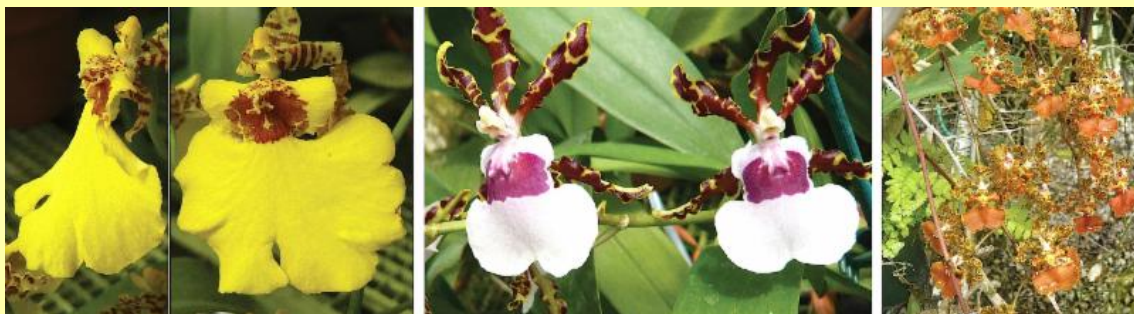
L to r: two views of Oncidium 'Sweet Sugar'; Odcdm. Wild Willie 'Wonka' and Trichocentrum 'Lundum' x Trichocentrum 'Cavendishianum'

I usually pot mine in bark mixture and water twice a week in the summer, less than once a week in the winter. I fertilize "weakly weekly." They stay in the greenhouse during winter (if no greenhouse - bring in the house). I usually repot oncidiums every two to four years.