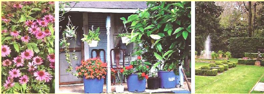
Influences, l to r, Native Americans taught newcomers to use native plants like purple coneflowers. Mexicans loved bright flowers in containers close to living quarters. French immigrants introduced us to sophisticated formal designs.