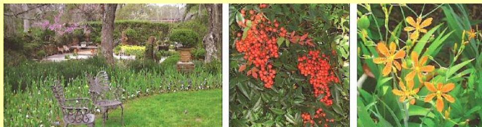
L to r, Italian immigrants brought their mastery of statuary and other landscape harscapes. Unique Asian garden "worlds" required plants with flowers and foliage that spoke to overall spirit