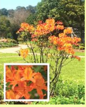
Left and center, our native wild azalea. Right, the wild azalea hybrid 'Stonewall Jackson' is blooming now at Mercer Botanic Garden.