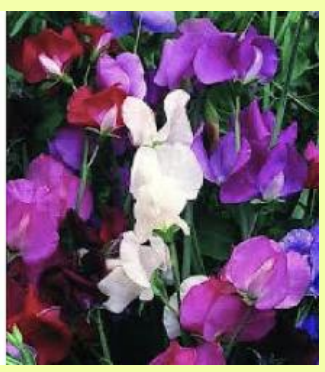
Always poignant: labeled plantings with specific meaning such as, left to right: carnations ("I'll never forget you") - coreopsis ("Always cheerful") - poppy ("Eternal sleep") - sweet pea ("Goodbye"). Zinnias (in center photo at top of column) translates "Thinking of - or n memory of - an absent friend."

As beautifully demonstrated around Marilyn's waterfall, curved pathways and other flowing lines invite relaxing, soothing, inviting meditation. Straight lines project more energy, formality, a signal to festinate on through.