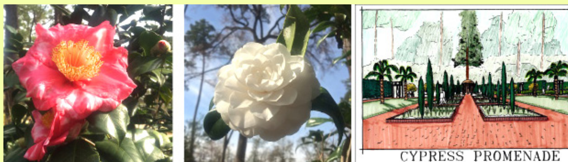
Excitement at Mercer Botanic Gardens : Thelma Mercer's incredible camellias, 'R.L. Wheeler,' left, and 'Seafoam,' center. Right; a rendering of the Cypress Promenade for Mercer's proposed Renaissance Garden.

Next time we have a sunny day, grab it and hie yourself out to Mercer Botanic Gardens in North Harris County for a dose of beautiful. Think of Mercer as our living plant library. Now's the time to see which plants you might like to have for color in your own garden in February. That's not to say they might not get wiped out by a late super-freeze. But we're getting very close to spring now.