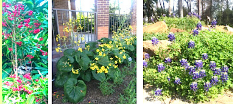
Right, birds will thank you for planting fire engine red coralberries. Although the giant leopard plants by Storey Pond had lost their yellow flowers, those by the Visitor's Center (center) were still gorgeous. And why wait for bluebonnets when Mercer has them in full bloom!