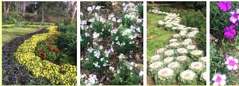
Left to right: Viola 'Penny Yellow' joins a sweep of geraniums and other winter bloomers. Nemesia 'Opal Innocence.' A sweep of ornamental cabbage. Far right: Dianthus 'Diana Lavender Picotee.' If you have questions, don't hesitate to ask the staffers!