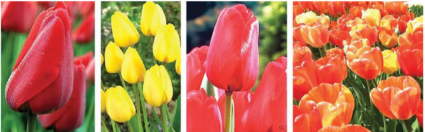
Sherrie has planted (above, l to right) 'Red Parade,' 'Golden Parade,' 'General Eisenhower' and 'Gudoshnik.' (*All file photos).

101 Sherbrook Circle • Conroe, Tx 77385-7750 (936) 321-6990 Metro • (936) 273-1200 Conroe