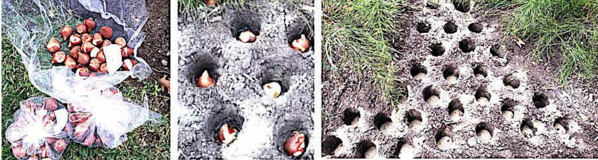
Left to right, 100 bulbs, holes dug and hilled tulips planted!