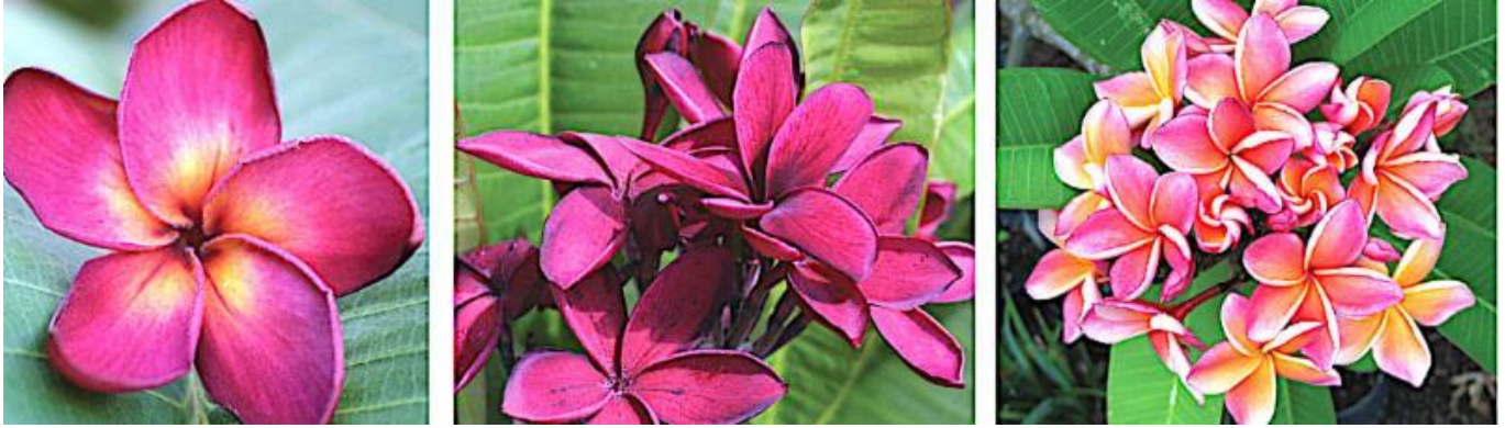
Tried and true plumeria favorites include Hawaiian cultivars: 'Duke', 'Hilo Beauty' and 'Penang Peach'