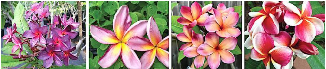
Black Purple, JL Metallica, 'George Brown' (aka Musk Rainbow) from Australia and J-105 from Thailand

To date: lavender, purple, orange, and red.