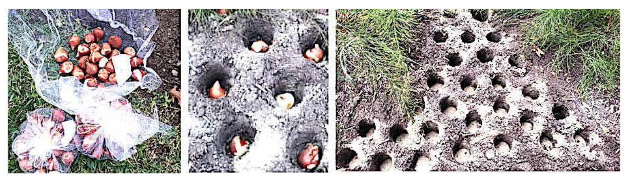
Left to right, 100 bulbs, holes dug and hilled tulips planted!