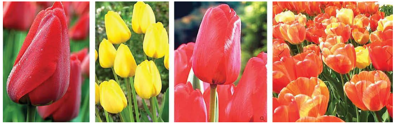
Sherrie has planted (above, I to right) 'Red Parade,' 'Golden Parade,' 'General Eisenhower' and 'Gudoshnik.' (*All file photos).

101 Sherbrook Circle • Conroe, Tx 77385-7750 (936) 321-6990 Metro • (936) 273-1200 Conroe