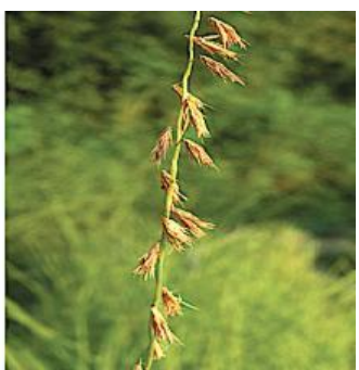
L to R: Gulf vervain, Lanceleaf coreopsis, Missouri ironweed and Sideoats grama.