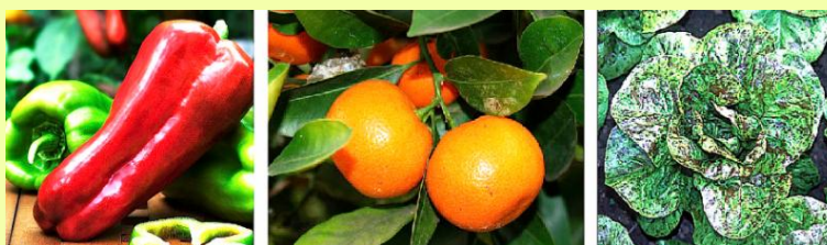
Left to right: Big Bertha bell pepper, calamondins, speckled romaine lettuce