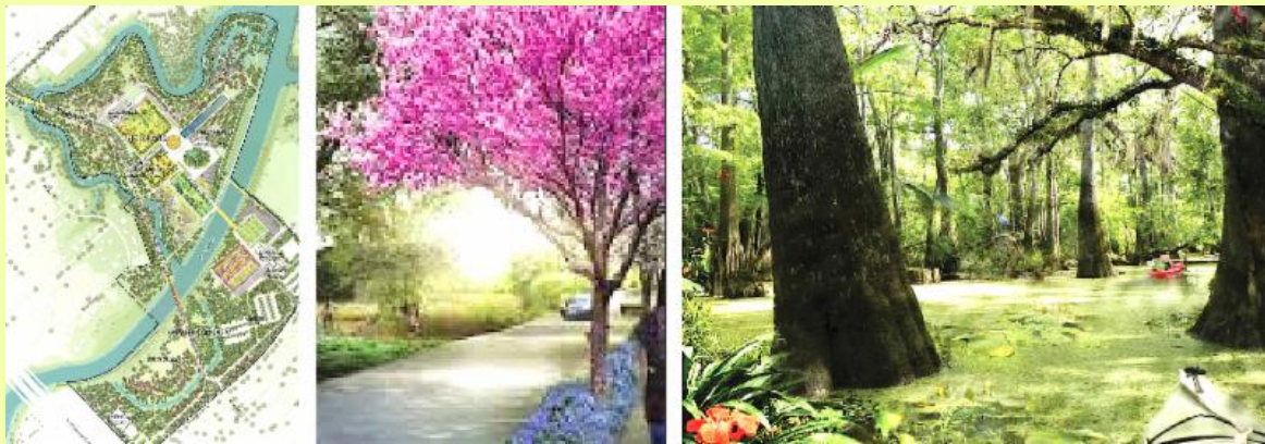
Left, the Botanic Mile (brown strip) runs from upper left to lower center, over Sims Bayou. Center, color planned for "the mile." Right, "flood zone" areas will be utilized in the design. All renderings courtesy of West 8.

By weaving together shady pathways, a mosaic of ever-changing gardens, the bayou and other water bodies, West 8's Master Plan for Houston Botanic Garden amplifies the potential of the site's qualities and unites the site into a coherent, "only-in-Houston," garden experience.