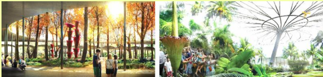
Left, shaded areas will be in integral component in Houston's heat. Right, a glass conservatory design inspired by a Victoria lily.