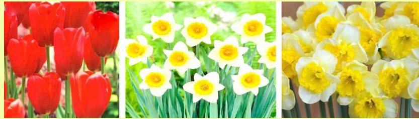
. . . Top, left to right, Tulip 'Sky High Scarlet,' Daffodils 'Big Gun' and 'Curly,' and, below, Hosta 'Guacamole' and Allium 'Purple Sensation.'