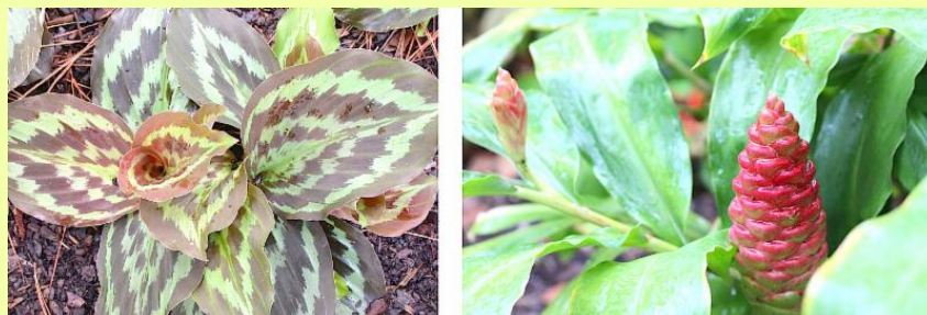
Among the outstanding gingers that will be available at Mercer Botanic Gardens' Autumn Plant Sale & Market, Sept. 28, will be (top l to r) Curcuma Laddawan , Curcuma 'Fireflies' (with butterfly), and Hedychium 'Kong' (up close and showing off its height!) Below, Kaempferia 'Alva' and Zingiber 'Twice as Nice.'