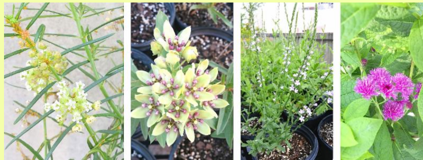
Choice plants from the Cockrell Butterfly Center's sale, l to r, Asclepias verticillata , Asclepias viridis , Verbena xutha and Vernonia (ironweed).

* SAT., SEPT. 26 COCKRELL BUTTERFLY CENTER FALL PLANT SALE , 9am-noon, Houston Museum of Natural Science Parking Garage/7th floor, 5555 Hermann Dr. Free parking with $30+ purchase. hmns.org